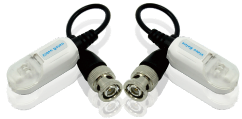
Video Balun HD UTP