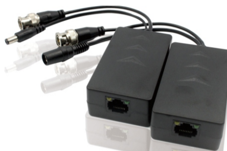
Power Transceiver Single Channel HD Video &