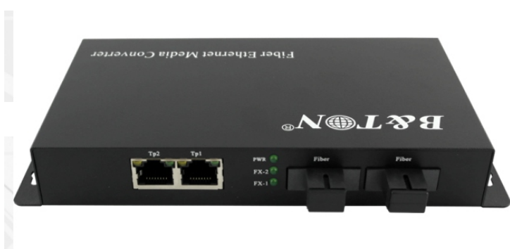
Unmanaged Fiber Switch Fiber Media converter