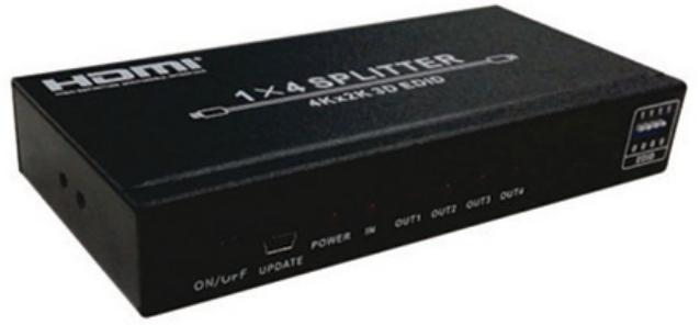
Splitter 1 × 4 WITH EDID