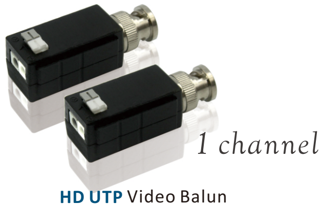
HD UTP Video Balun